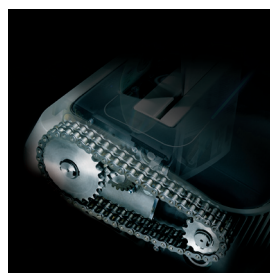
CHAIN heavy duty chain drive system and metal gears