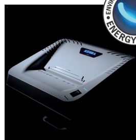
ENERGY SMART® management system with illuminated indicators for power saving in stand-by mode