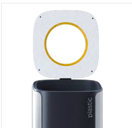
Quick and easy replacement of the bag.